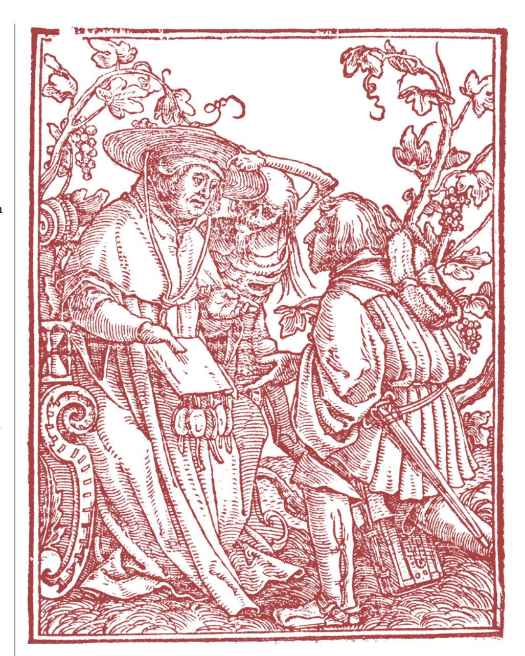
Death with a Cardinal, from Imagines de Morte (Lyon, 1542)

The woodcuts from all these items are being scanned into the Digital Image