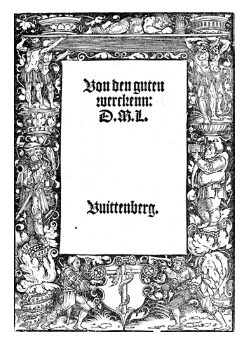
Luther, Von den guten werckenn (Wittenberg: Lotter, 1520)