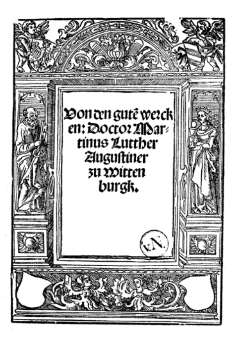
Luther, Von den gute[n] wercken (Nuremberg: Peypus, 1520)