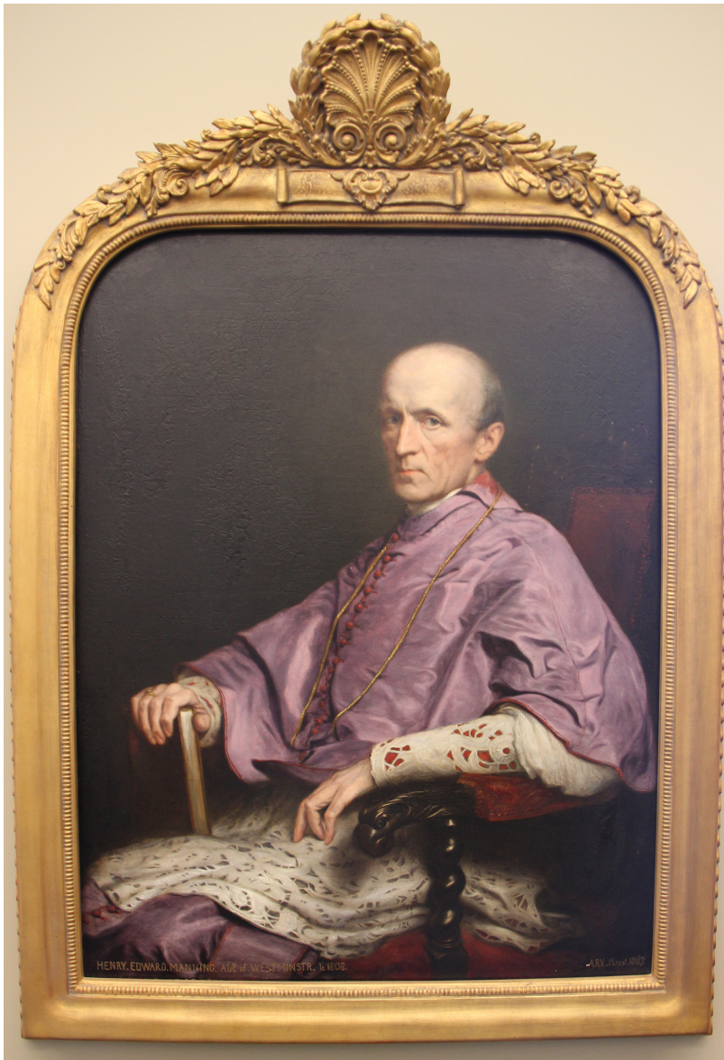
Oil portrait of Cardinal Manning, 1867, held by Pitts Theology Library